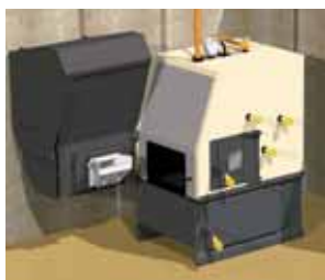
Hopper swings open for access to burn pot.